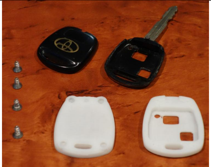
Figure 1 - Parts Ready for Assembly - Broken key casing in background. Remote control module not shown.