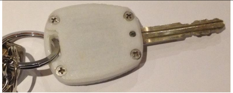
Finished Key Casing Bottom

Material Weight - 9 gramme Build time - 37 minutes each part Requires 4 screws #4*10 CSK