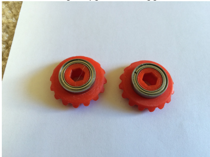
Install the two 623zz bearings onto the spider gears.