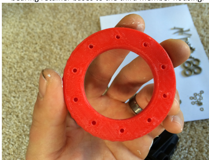
Clean and tap all the holes in the ring gear.