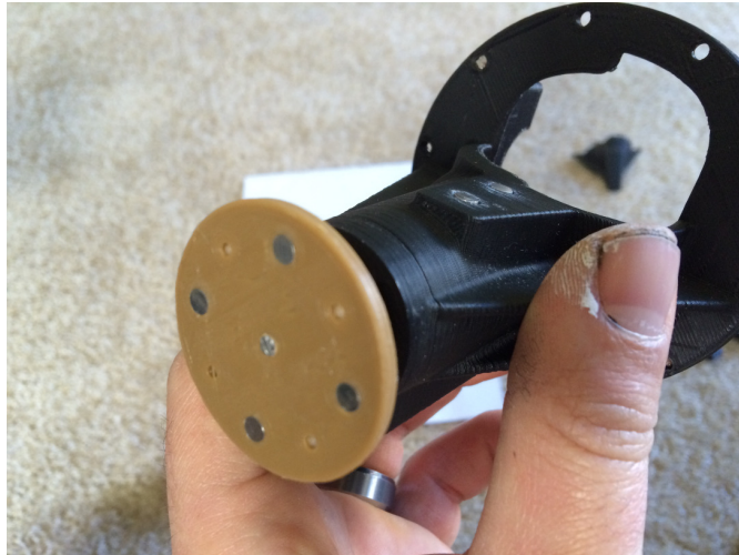
Install drive flange.