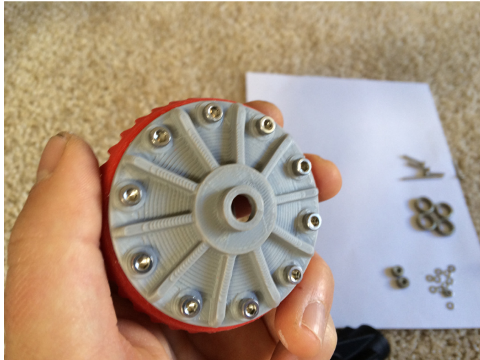
Install the ring gear on to the Center Carrier Plate