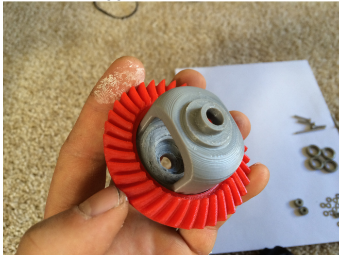
Using the ring gear as a guide, glue the center carrier housing to the center carrier plate. Being careful not to get any glue on the ring gear.