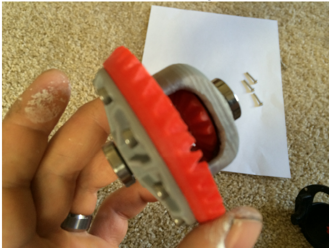
Install 6701zz bearings onto the center carrier housing.