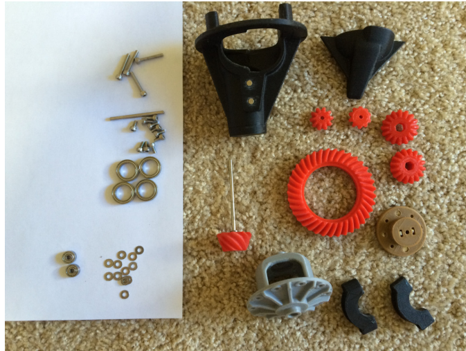
Lay out all the parts